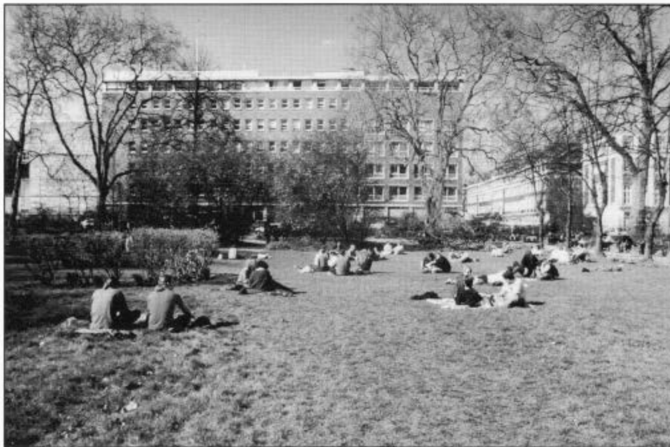
Figure 2 The building occupied by the Institute of Archaeology today, seen from Gordon Square.

London (UCL), its nearest academic neighbour and the largest multifaculty school of the University. This took place in 1986, while Sir James Lighthill was Provost of UCL, and was preceded by complex negotiations on the academic, financial and administrative implications of the “merger” – a rather mechanistic term for what was in reality the long-delayed realization of part of Mortimer Wheeler’s original vision for his Institute. 7 During the protracted discussions that followed Wheeler’s original approach to the University in 1927, University College had appointed him to a part-time Lectureship in Prehistoric Archaeology and had agreed to transfer its Egyptology and Classical Archaeology Collections to the proposed new Institute of Archaeology. In 1934 the College even offered space for the Institute at a nominal rent in a former stable it had acquired in Foster Court (where the Petrie Museum of Egyptian Archaeology is now housed); an offer that was, however, soon eclipsed by the more alluring prospect of much more spacious accommodation in St John’s Lodge. So, the Egyptology and Classical Archaeology collections remained at UCL (where chairs in both subjects had been established in the late nineteenth century) and