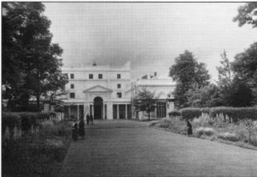
Figure 1 The first home of the Institute of Archaeology: St John's Lodge, Regent's Park, in 1937.

By far the most significant development at this time was, however, the incorporation of the Institute into University College