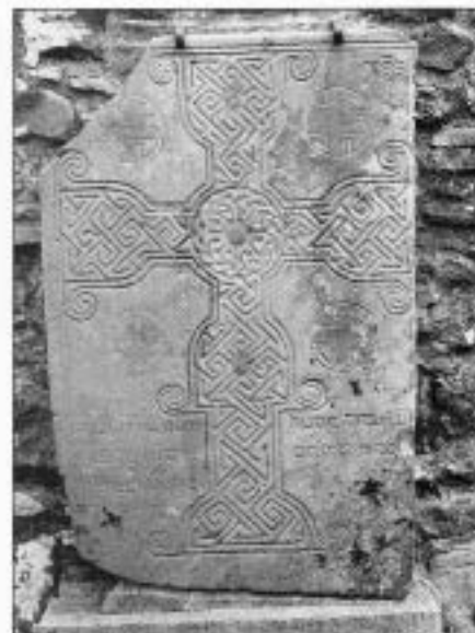
Figure 2 Irish grave-slab of eighth- or ninth-century AD date from Tullylease, Co. Cork, calling for prayers for a man with an Anglo-Saxon name, Berechtuine .

Work on the Breton inscriptions continues, but it is clear that there are three main concentrations: around Plourin; in the far east, at places such as Bais and Retiers; and on the south coast, near Crac'h and Langombrac'h. There are also some isolated inscriptions, both in inland areas such as Guer and Sainte-Tréphine, and in coastal areas such