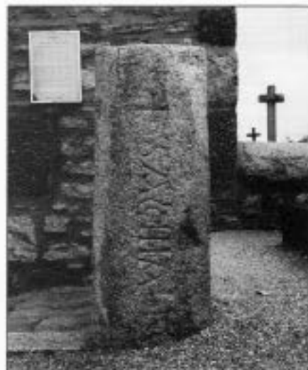
Figure 3 The Gallmau stone from Lanri-voaré, in northwest Brittany, is a small Iron Age stele, inscribed vertically downwards with a single Breton name in Insular decorative capitals of the seventh or eighth century AD, preceded by a cross.