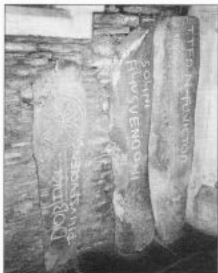
Figure 1 Three Welsh memorial stones of fifth- or sixth-century AD date from the churchyard at Clydai, Pembrokeshire, with vertical Latin inscriptions, although those at either end of the row are bilingual, with additional ogham inscriptions (the cross on the left-hand stone was added later).