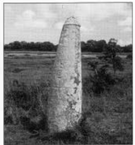
Figure 6 The Prostlon stone from Loccal-Mendon, in the Morbihan, may have been raised for Prostlon, who was the daughter of Salomon, the ruler of Brittany in the late ninth century.

Inscriptions, by definition, are contemporary written records from a particular place and time. Thus, in regions such as Brittany, where we have so little written information before the ninth century AD, the epigraphic record can provide an invaluable series of insights into literacy, language change, systems of commemoration, the monumentalization of the landscape, gender and the proclamation of real or desired status (Fig. 6). By collecting and studying these “texts in the landscape”, the project aims to present a new vehicle and tool for the study of Celtic societies in the early medieval period.