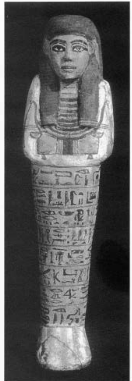
Figure 2 An ancient Egyptian funerary figure made of painted wood, from the eighteenth dynasty, 1550–1295 BC; height 28.8 cm (museum no. UC 8824).