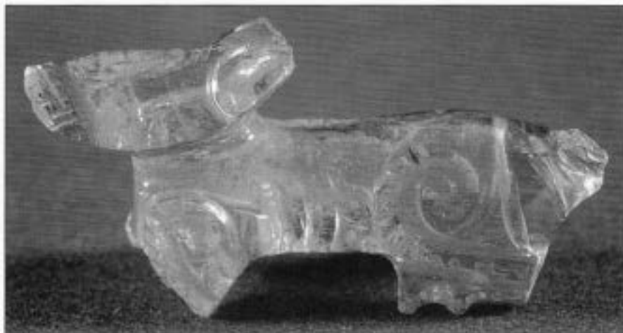
Figure 3 The Petrie Museum houses many objects from Islamic Egypt, such as this cosmetics container made of rock crystal from the Fatimid period, 969–1171 AD (museum no. UC 25300).

handling sessions on ancient and modern Egypt in London schools.