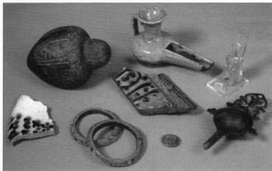
Figure 4 (above) Objects from the Petrie Museum's Islamic Egypt handling collection for secondary schools, developed in conjunction with the British Museum's Arab World Education Officer.

Our main outreach initiatives will, however, be on line. Money from the government's funding for designated museums has enabled us to embark on an ambitious programme of digitization, to create by March 2002 a complete illustrated online catalogue of the museum's 80 000 objects (Fig 5). Through this project we aim to make our rather under-used collection available anywhere in the world, by providing a digital resource for students, schoolchildren and anyone interested in Egyptian archaeology. It should also vastly improve service to our existing academic audience, allowing students and researchers worldwide to plan their work and make best use of their time when they visit the museum. A further benefit of digitization is that we will be able to use the data as the basis of improved information systems to help us to manage the collection more efficiently. And it opens the way for