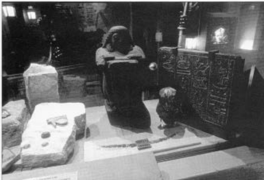
Figure 1 A display in "Ancient Egypt: digging for dreams", a touring exhibition of objects from the Petrie Museum. This view is of part of the section on Western fantasies of ancient Egypt. A clip from the 1932 film The Mummy plays in the background. Croydon, November 2000.

the formal education sector. Few non-specialists are aware of the vast chronological scope of the museum's collections, from the Palaeolithic through to Islamic Egypt (Figs 2, 3). As a first step towards broadening their use, three handling collections have been developed and piloted for different audiences: an ancient Egypt collection for primary schools, an Islamic Egypt collection for secondary schools (Fig. 4), and a Classical Egypt collection for use in tertiary education. The museum is currently exploring the possibility of employing, in partnership with the British Museum's Education Department, an Arabic-speaking outreach teacher to run