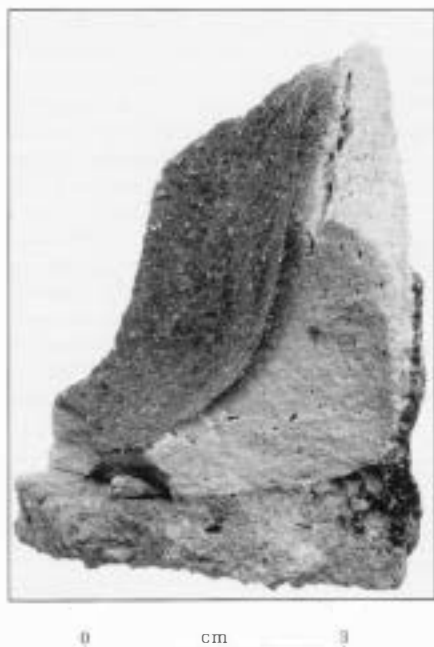
Figure 1 A crucible fragment from Gyaur Kala, Merv, showing a cross section through the lower wall and the supporting pad below.

Further observation and analysis of the insides of the crucibles suggested that the green glassy fin was shaped when, in liquid form, it had floated on the periphery of the convex upper surface of a denser liquid such as a molten metal. The metallic prills trapped in the green glassy fin were analyzed by optical and electron microscopy and, with one exception, were found to consist of high-carbon steel. This also threw light on the small rust-coloured nodules found on the interior walls, some of which contained remnants of steel. Both